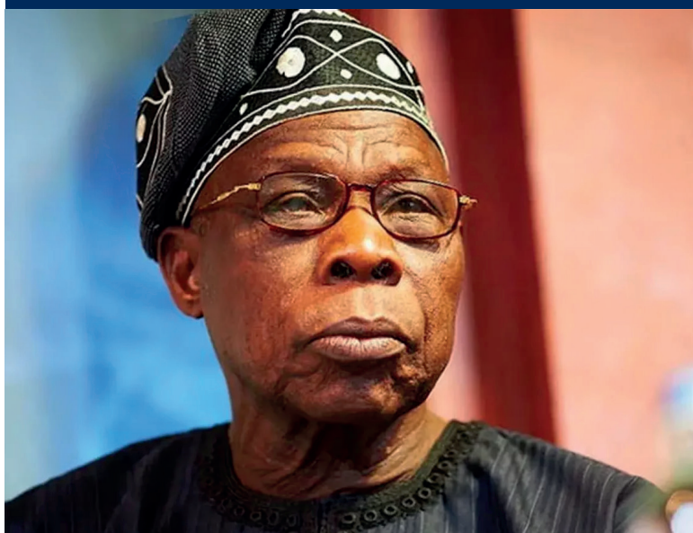
Warm regards, His Excellency, Chief Olusegun Obasanjo Former President of the Federal Republic of Nigeria

I ndustry Colleagues, distinguished guests and captains of industry, I am honoured to provide this welcome to each one of you as we prepare together for the West African Energy Summit (WAES) in Accra. In partnership with Hon. Minister Matthew Opoku Prempeh, Minister of Energy for the Republic of Ghana, this Summit marks a momentous occasion where our continent takes control of its natural resources and welcomes the world to develop sustainable projects for regional and international utilisation. This event truly reflects the needs of the region and the industry sector with regard to new project horizons and energy security, that we can all benefit from.