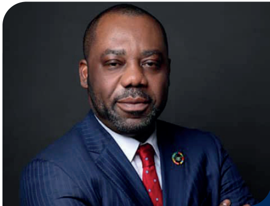
Hon Minister Matthew Opoku Prempeh, Minister of Energy Republic of Ghana

Ladies and Gentlemen, industry leaders. It is with great pleasure and anticipation that I extend a warm invitation to industry as we prepare to convene in Accra for the West African Energy Summit in September 2024.