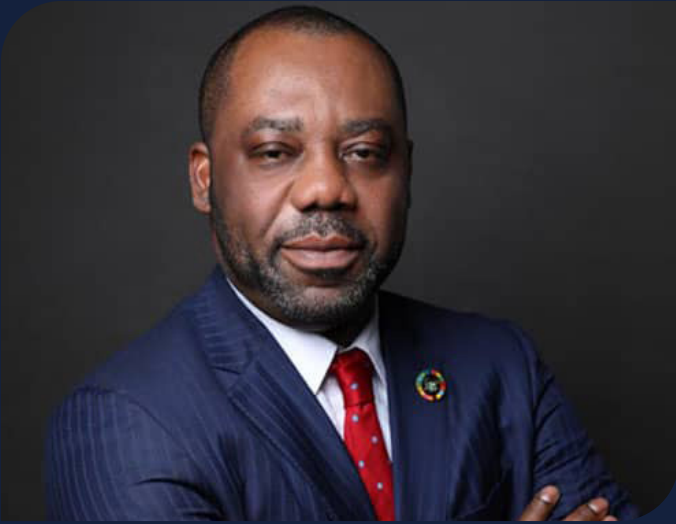
Message from Hon Minister Matthew Opoku Prempeh, Minister of Energy Republic of Ghana

Ladies and Gentlemen, industry leaders. It is with great pleasure and anticipation that I extend a warm invitation to industry as we prepare to convene in Accra for the West African Energy Summit in September 2024.