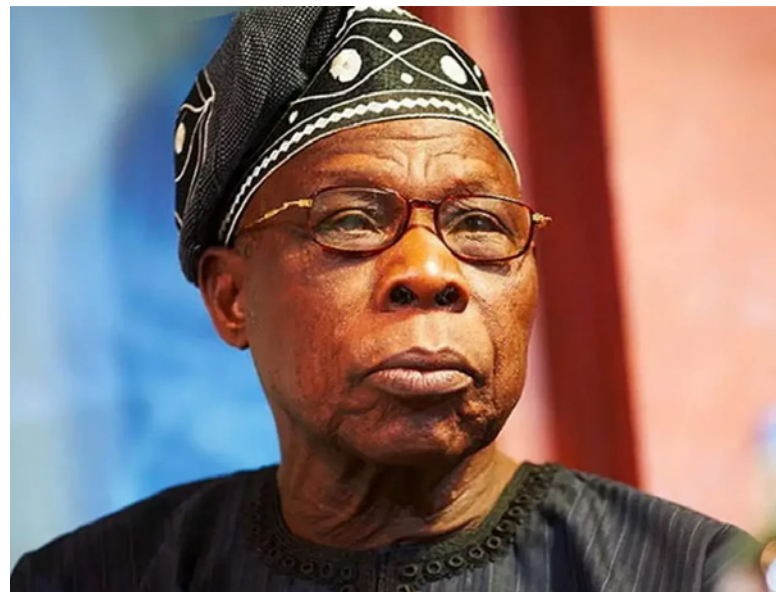
Warm regards, His Excellency, Chief Olusegun Obasanjo Former President of the Federal Republic of Nigeria

I thank our partners, the organisers, sponsors, and participants who have committed to making this summit a reality. Your commitment to advancing Africa's energy landscape aligns seamlessly with our collective aspirations for a continent that is economically robust, socially equitable, and environmentally responsible. Let this meeting be guided by our shared vision of a prosperous region where energy becomes a cornerstone of economic stability for West Africa. I welcome you all to this transformative gathering and look forward to fruitful engagements that will chart the course toward energy security and shared growth for our region and the partners who work within it.